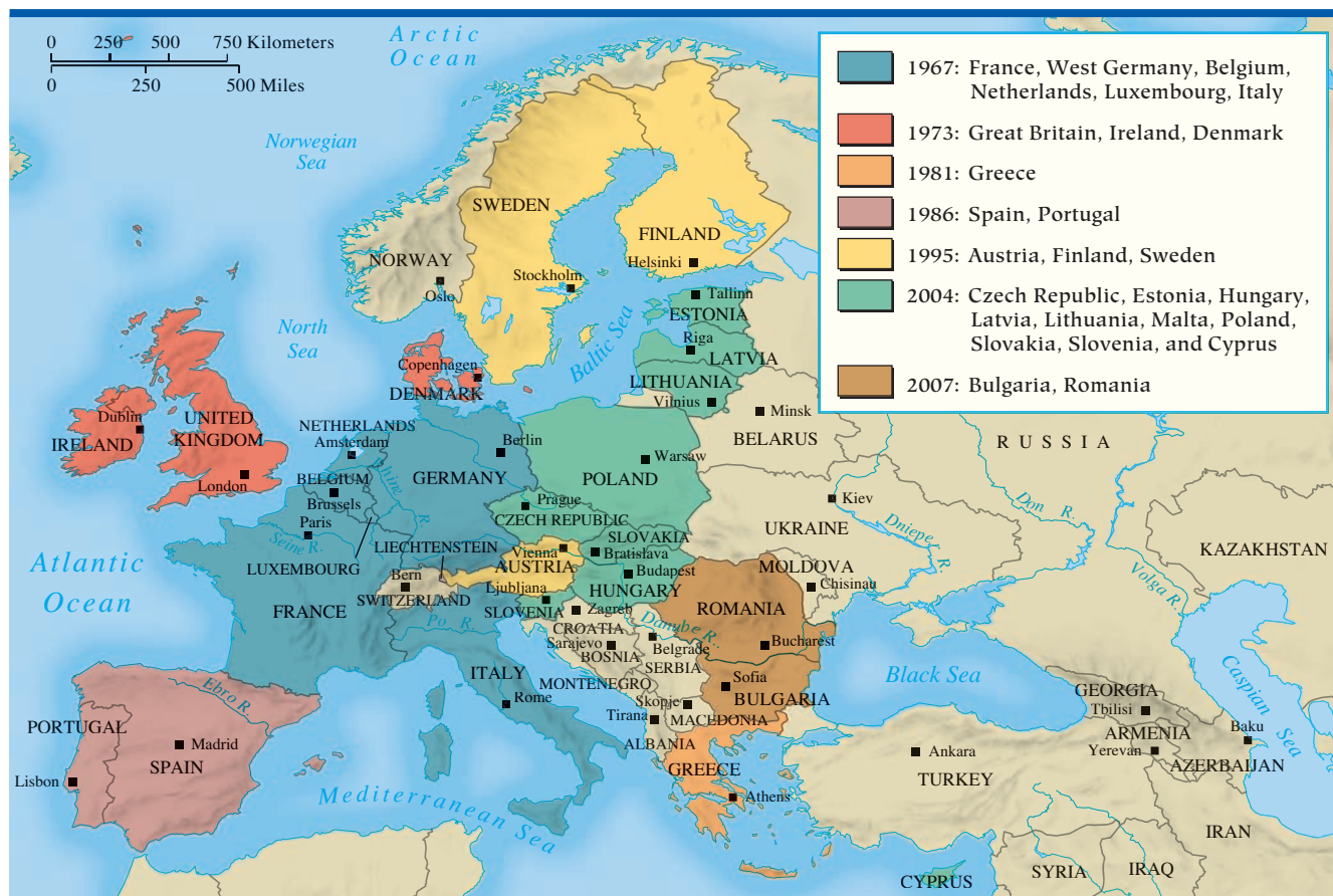
MAP 30.3 European Union, 2007. Beginning in 1967 as the European Economic Community, also known as the Common Market, the union of European states seeking to integrate their economies has gradually grown from six members to twenty-seven in 2007. By 2002, the European Union had achieved two major goals—the creation of a single internal market and a common currency—although it has been less successful at working toward common political and foreign policy goals.

Q What additional nations do you think will eventually join the European Union?