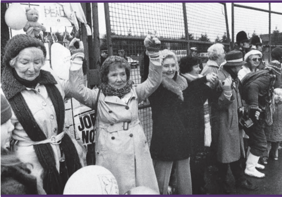
An Antinuclear Protest. Women were active participants in the antinuclear movement of the 1980s. Shown here are some of the ten thousand antinuclear protesters who linked hands to form a human chain around the 9-mile perimeter of the U.S. Air Force base at Greenham Common, England, on December 13, 1982. They were protesting the planned siting of ninety-six U.S. cruise missiles at the base.

that haunt their lives. Despite these differences, the meetings were an indication of how women in both developed and developing nations were organizing to make people aware of women's issues.