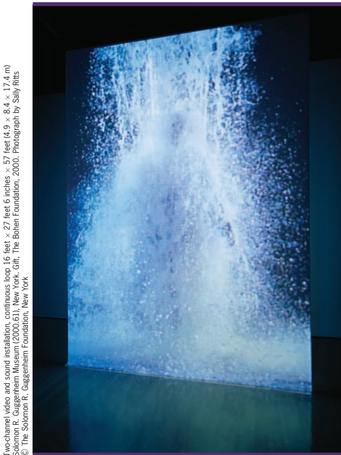
Two-channel video and sound installation, continuous loop 16 feet \times 27 feet 6 inches \times 57 feet (4.9 \times 8.4 \times 17.4 m) Solomon R. Guggenheim Museum (2000.61), New York. Gift, The Bohen Foundation, 2000.

Contemporary artists also continue to explore the interaction between the Western and non-Western world, particularly with the multiculturalism generated by global migrations (see “The Social Challenges of Globalization” later in this chapter). For example, the art of Yinka Shonibare (YEEN-kuh SHOW-nih-bar-eh) (b. 1962), who was born in London, raised in Nigeria, and now resides in England, creates works that investigate the notion of hybrid identity. This is evident in his work, How to Blow Up Two Heads at Once (Gentlemen) , which depicts European Victorian figures dressed in Dutch wax cloth.