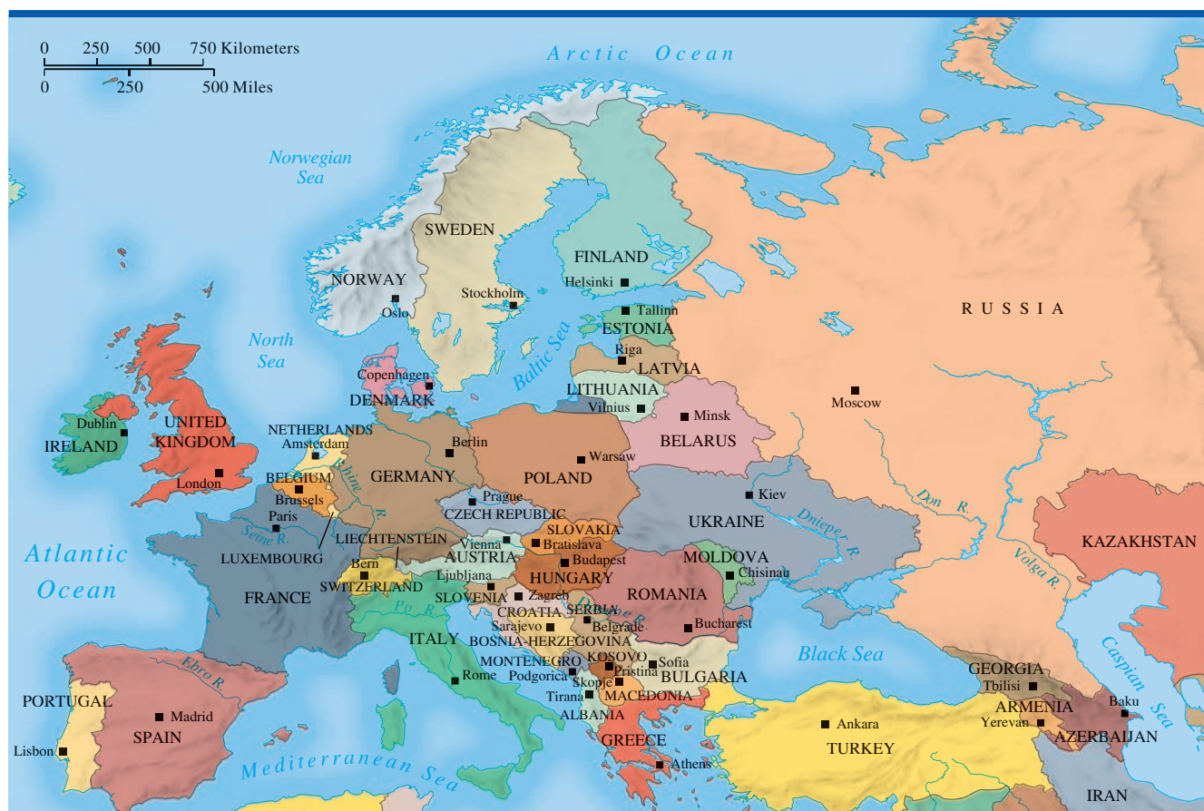
MAP 30.1 The New Europe. The combination of an inefficient economy and high military spending had led to stagnation in the Soviet Union by the early 1980s. Mikhail Gorbachev came to power in 1985, unleashing political, economic, and nationalist forces that led to independence for the former Soviet republics and also for Eastern Europe.

Q Compare this map with Map 28.1. What new countries had emerged by the early twenty-first century?