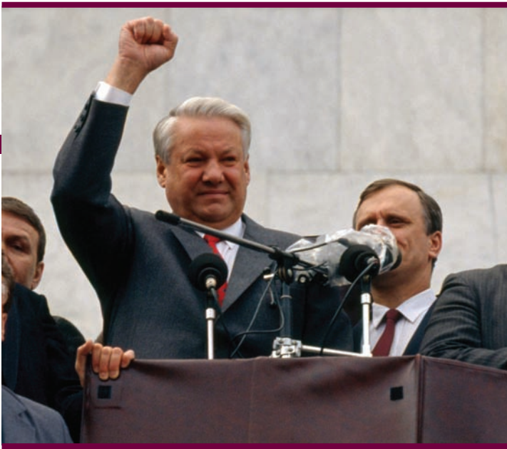
With clenched fist, Boris Yeltsin speaks out against an attempted right-wing coup.