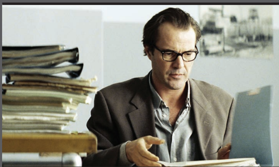
Georg Dreyman (Sebastian Koch) examines his Stasi files.

an actress in some of Dreyman's plays. Captain Gerd Wiesler (Ulrich Muehe) of the Stasi takes charge of the spying operation. He is the epitome of the perfect functionary—a cold, calculating, dedicated professional who is convinced he is building a better society and is only too eager to fight the “enemies of socialism.” But in the course of listening to the everyday details of Dreyman's life, Wiesler begins to develop a conscience and becomes sympathetic to the writer. After a close friend of Dreyman's commits suicide, Dreyman turns against the Communist regime and writes an article on the alarming number of suicides in East German society for Der Spiegel , a West German magazine. Lieutenant Colonel Grubitz (Ulrich Tukur), Wiesler's boss, suspects that Dreyman is the author. His girlfriend is brought in for questioning and provides some damning information about Dreyman's involvement. Horrified by what she has done, she commits suicide, but Wiesler, who is now determined to save Dreyman, fudges his reports and protects him from being arrested. Wiesler's boss suspects what Wiesler has done and demotes him. The film ends after the fall of the Berlin Wall when the new German government opens the Stasi files. When Dreyman reads his file, he realizes how Wiesler saved him and writes a book dedicated to him.