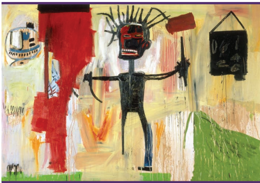
Jean-Michel Basquiat, Self Portrait , 1986. In his paintings, Basquiat combined Abstract Expressionist brushwork with the popular culture of urban life. He dabbled with hip-hop and included references to comic book characters, jazz musicians, and sports heroes in his work.

(see Chapter 29). In the early 1990s, rappers like Dr. Dre and Snoop Doggy Dogg created “gangsta rap,” an offshoot of hip-hop with raw lyrics praising violence, drugs, and promiscuous sex. By the late 1990s, teen and preteen consumers had steered the music industry back to pop music, generating millions of dollars of sales in the process. Many pop acts became successful as music turned away from grunge and gangsta rap. Instead, musicians and audiences favored the lighthearted music that made Ricky Martin and Britney Spears famous. Drawing from rhythm and blues, Latin music, and hip-hop, these artists used catchy dance beats and extravagant music videos to market their work.