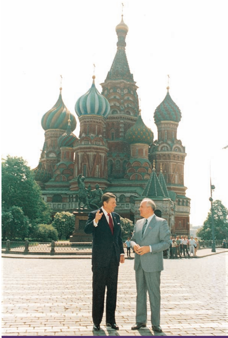
Reagan and Gorbachev. The willingness of Mikhail Gorbachev and Ronald Reagan to dampen the arms race was a significant factor in ending the Cold War confrontation between the United States and the Soviet Union. Reagan and Gorbachev are shown here standing before Saint Basil's Cathedral during Reagan's visit to Moscow in 1988.

upheaval swept through Eastern Europe. Gorbachev's policy of allowing greater autonomy for the Communist regimes of Eastern Europe meant that the Soviet Union would no longer militarily support Communist governments that faced internal revolt. The unwillingness of the Soviet regime to use force to maintain the status quo, as it had in Hungary in 1956 and in Czechoslovakia in 1968, opened the door to the overthrow of the Communist regimes. The reunification of Germany on October 3, 1990, marked the end of one of the most prominent legacies of the Cold War.