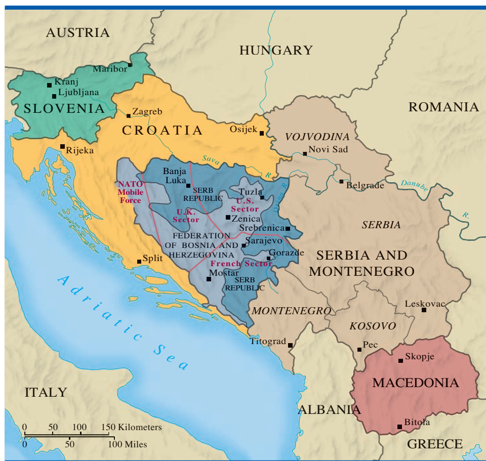
MAP 30.2 The Lands of the Former Yugoslavia, 1995. By 1991, resurgent nationalism and the European independence wave overcame the forces that held Yugoslavia together. Declarations of independence by Slovenia, Croatia, and Bosnia-Herzegovina led to war with the Serbian-dominated rump Yugoslavia of Slobodan Milošević.

Q What aspects of Slovenia's location help explain why its war of liberation was briefer and less bloody than others in the former Yugoslavia?